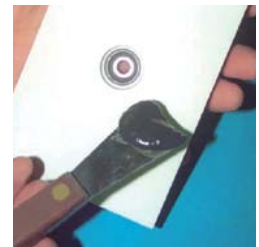
Aremco-Bond™ 2150 bonds ceramic wear tile.