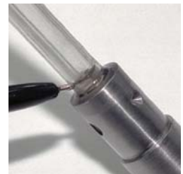
Aremco-Bond™ 631 bonds sapphire tube to stainless steel.