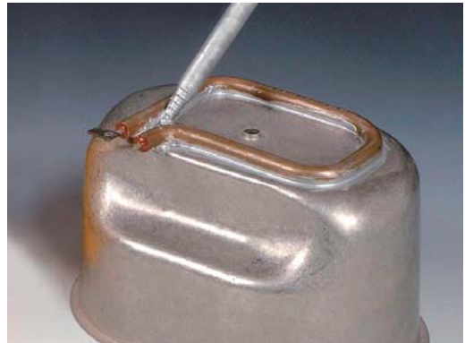
Aremco-Bond™ 568 bonds copper coil.