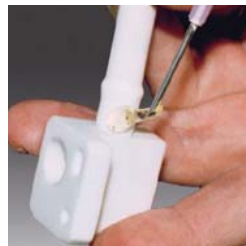
Aremco-Bond™ 526N bonds alumina to alumina ceramic.