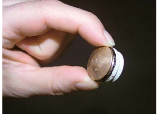
Aremco-Bond™ 570 bonds ceramic to copper nozzle.